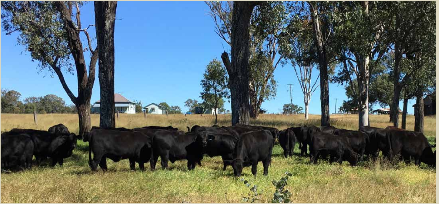
A Magnificent run of replacement Angus x Santa heifers at 'Palyah' which will be joined in spring to Burenda Black bulls.