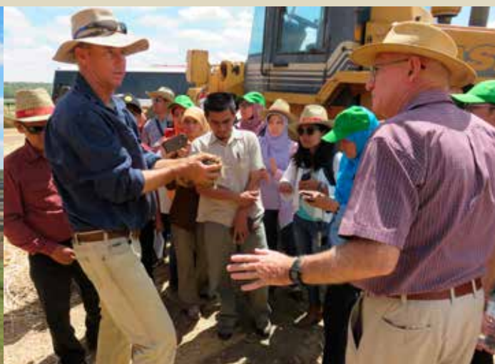
Interpreting what is in the silage ration and inspection of the Dalby Downs D forcing yard.